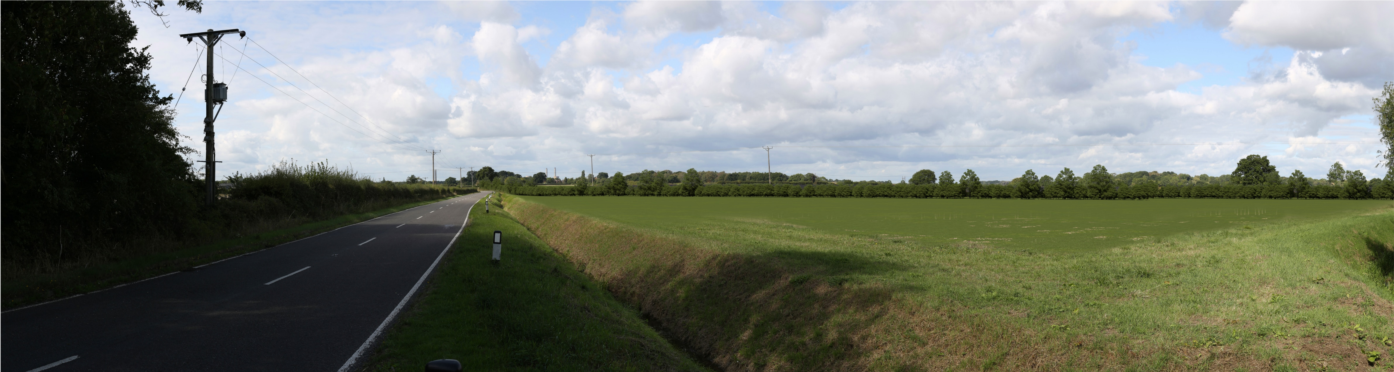
Proposed View Year 15 Distance to Nearest Order Limits 0m

Viewpoint 10a - Summer View northwest from B1241 (Kexby Lane) Easting 385623 Northing 15.2 AOD Camera Type Lens Height Above AOD Angle of View Canon 5D MkIII 50mm 1.6m 120 ° Date Time 15/09/2022 10:53