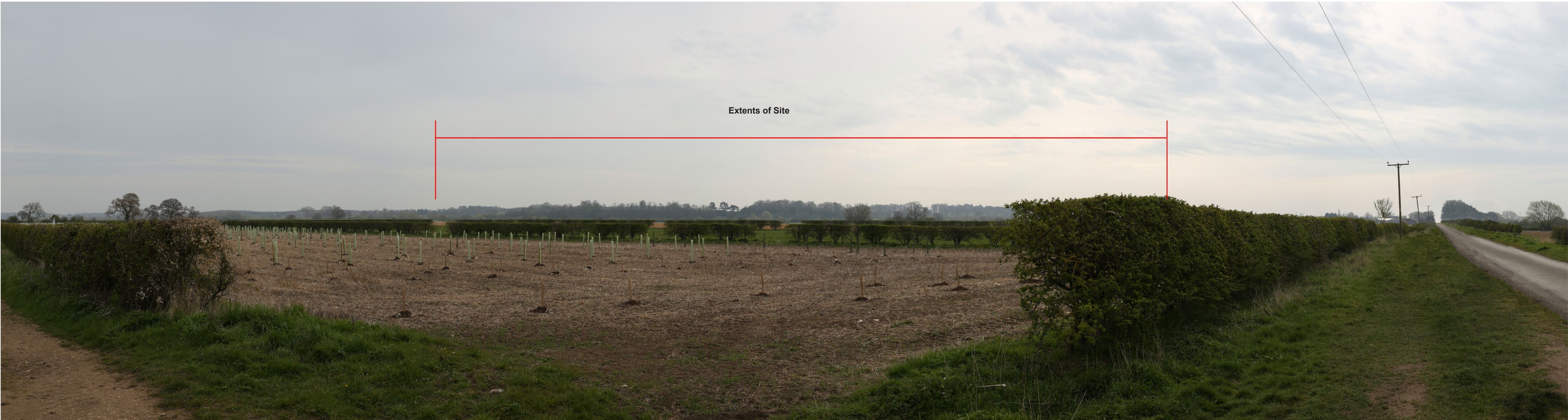
Proposed View Year 1 Distance to Nearest Order Limits 1600m

Viewpoint 14 - Winter View east from Littleborough Road, Littleborough Easting481587 Northing383019 AOD5 Camera TypeCanon 5D MkIII Lens50mm Height Above AOD1.6m Angle of View120 ° Date12/04/2022 Time08:40