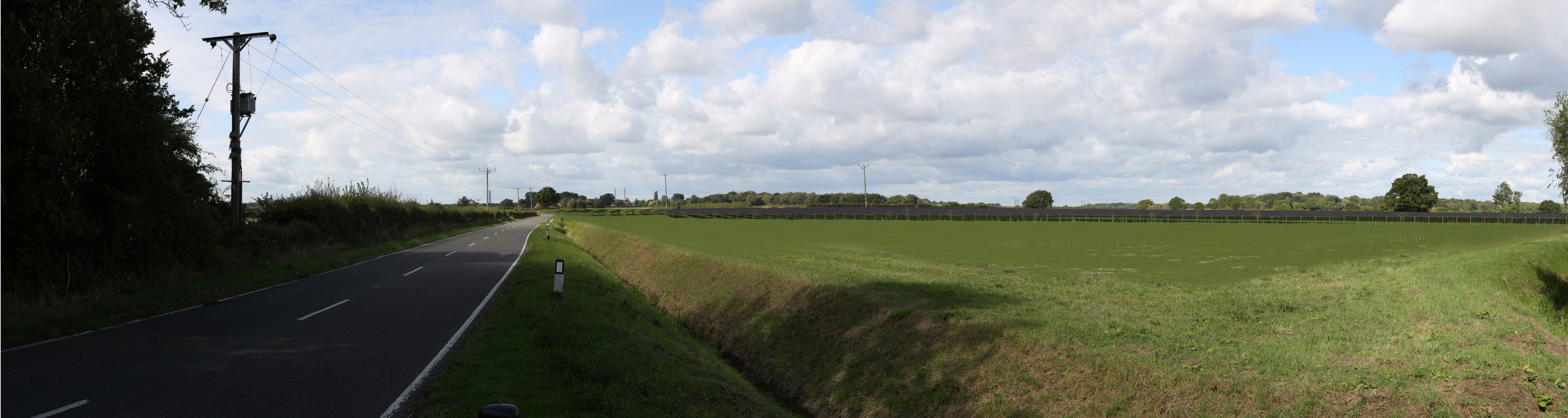
Proposed View Year 1 Distance to Nearest Order Limits 0m

Viewpoint 10-2 Summer View northwest from B1241 (Kexby Lane) Easting 485331 Northing 385623 AOD 15.2 Camera Type Canon 5D MkIII Lens 50mm Height Above AOD 1.6m Angle of View 120 ° Date 15/09/2022 Time 10:53