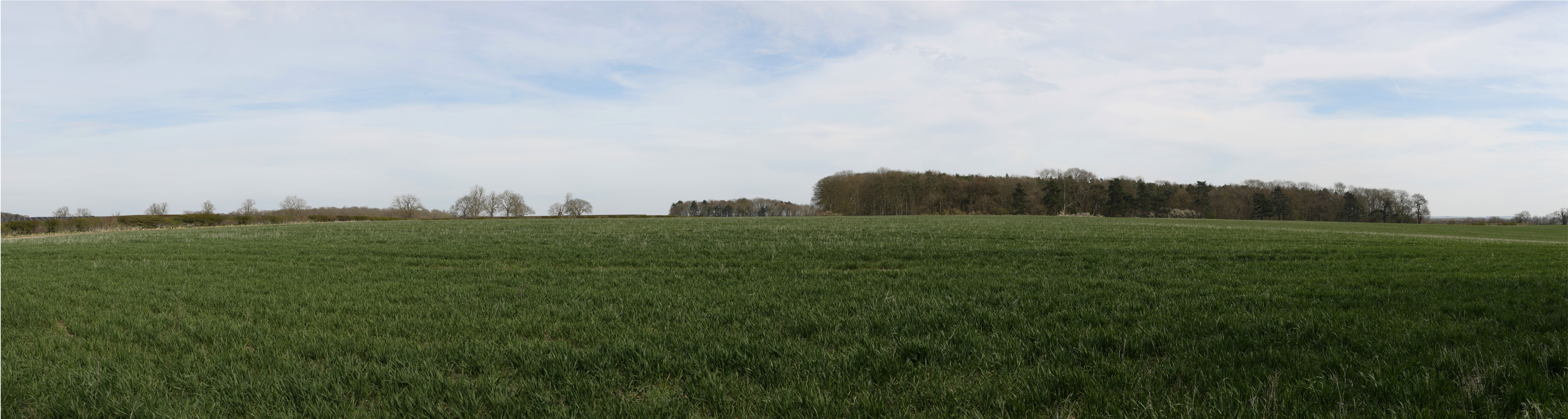
Proposed View Year 15 Distance to Nearest Order Limits 0m

Viewpoint 15 - Winter View east along view axis between Gate Burton estate and Burton Wood