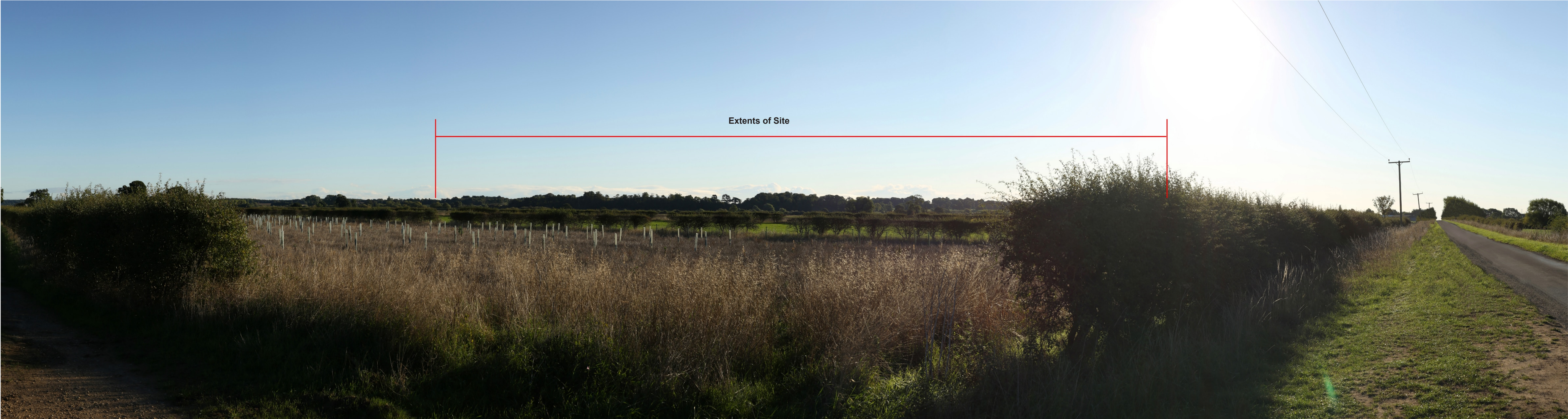
Proposed View Year 15 Distance to Nearest Order Limits 1600m

Viewpoint 14 - Summer View east from Littleborough Road, Littleborough Easting Northing AOD 481587 383019 5 Camera Type Lens Height Above AOD Angle of View Canon 5D MkIII 50mm 1.6m 120 ° Date Time 16/09/2022 07:14