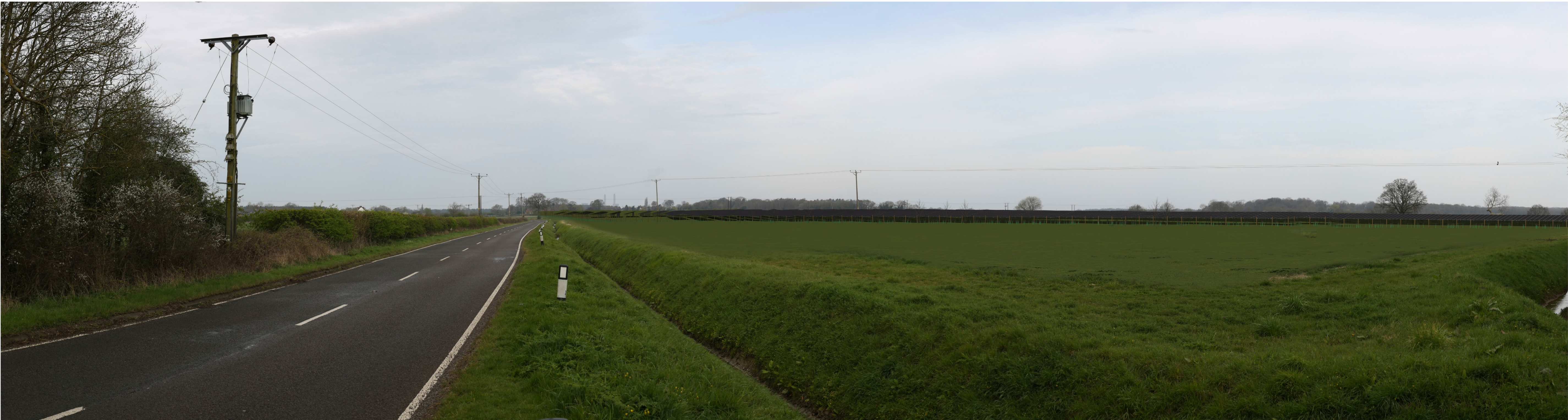
Proposed View Year 1 Distance to Nearest Order Limits 0m