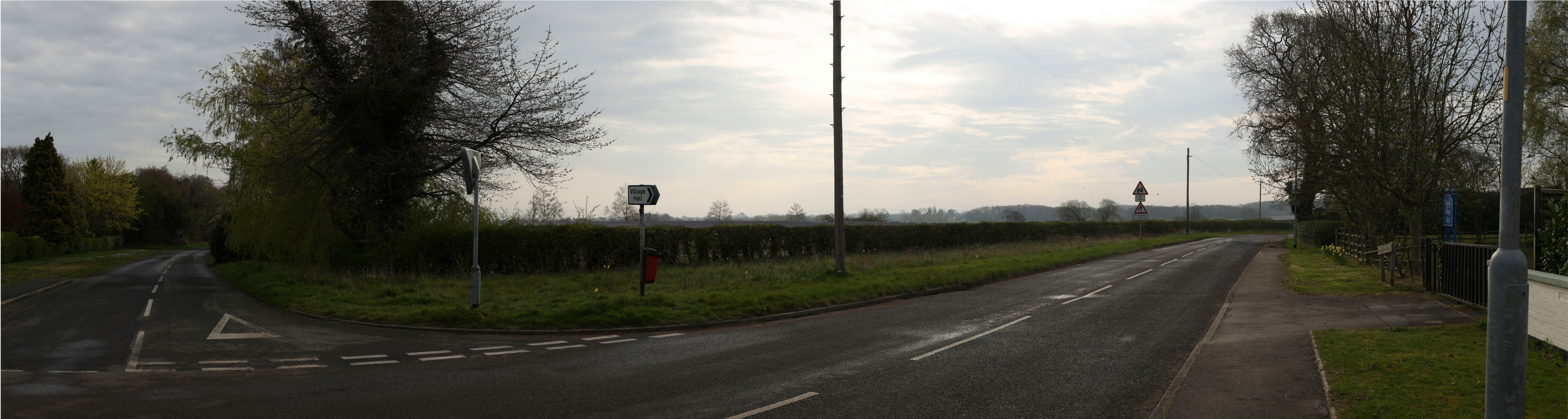
Proposed View Year 15 Distance to Nearest Order Limits 295m