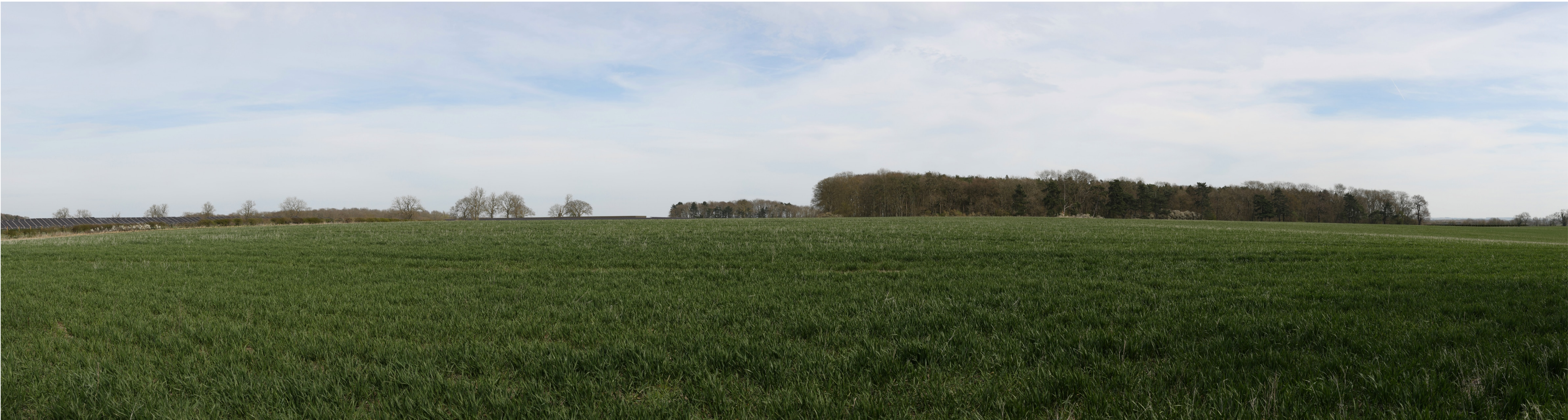
Proposed View Year 1 Distance to Nearest Order Limits 0m

Viewpoint 15 - Winter View east along view axis between Gate Burton estate and Burton Wood Easting 483906 Northing 383163 AOD 27.7 Camera Type Canon 5D MkIII Lens 50mm Height Above AOD 1.6m Angle of View 120 ° Date 11/04/2022 Time 12:52