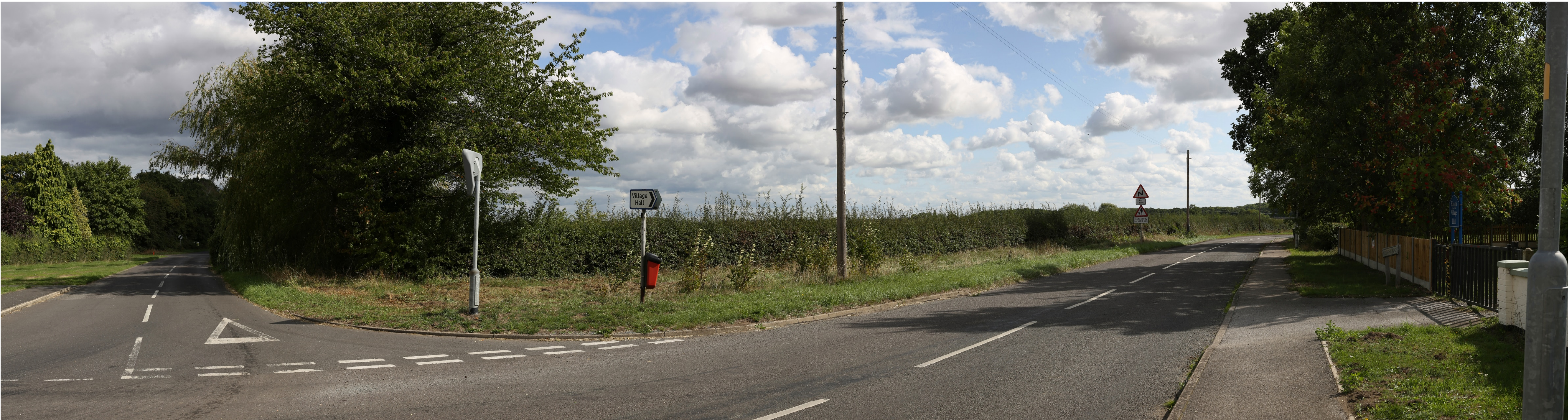
Proposed View Year 1 Distance to Nearest Order Limits 295m

Viewpoint 11 - Summer View east from B1241 (Kexby Lane) at eastern entry to Knaith Park Easting 484333 Northing 385657 AOD 23 Camera Type Canon 5D MkIII Lens 50mm Height Above AOD 1.6m Angle of View 120 ° Date 12/04/2022 Time 07:36