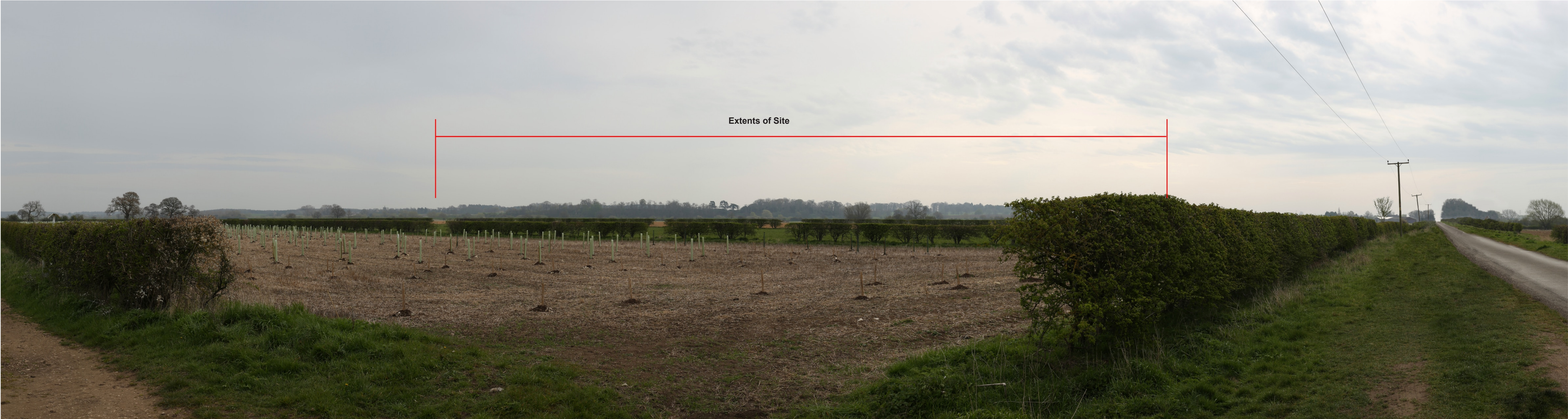
Proposed View Year 15 Distance to Nearest Order Limits 1600m