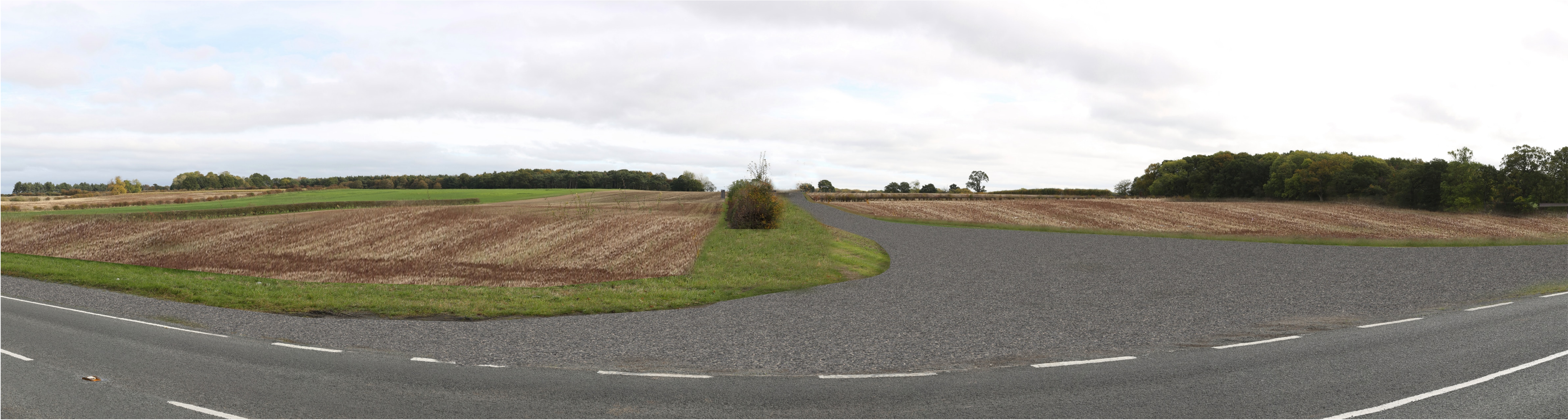
Proposed View year 15

Viewpoint 13 - Winter View east from A156 (Gainsborough Road) between Knaith and Gate burton