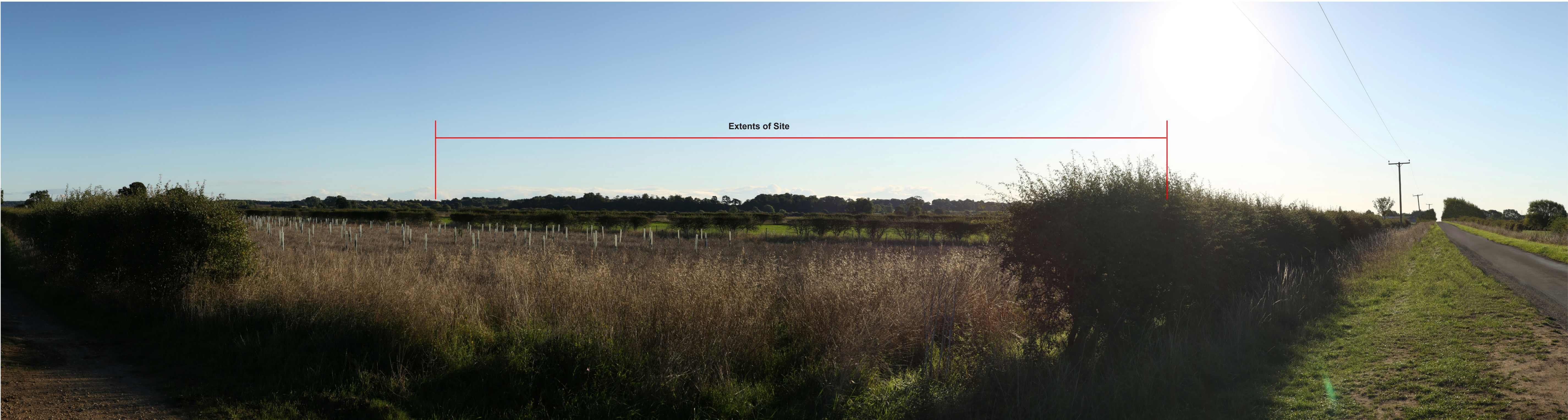
Proposed View Year 1 Distance to Nearest Order Limits 1600m