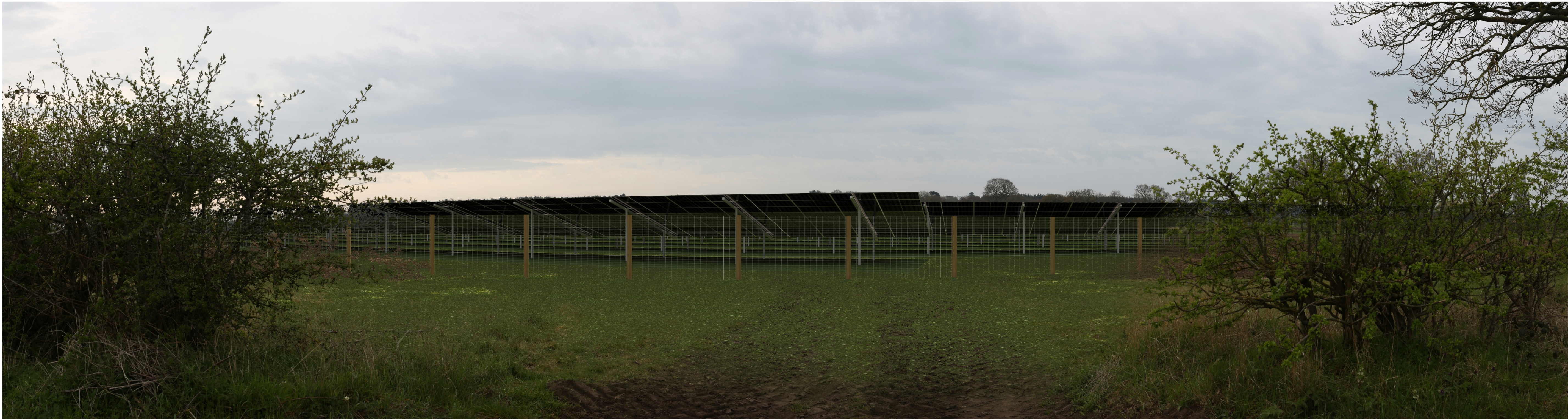
Proposed View Year 1 Distance to Nearest Order Limits 0m