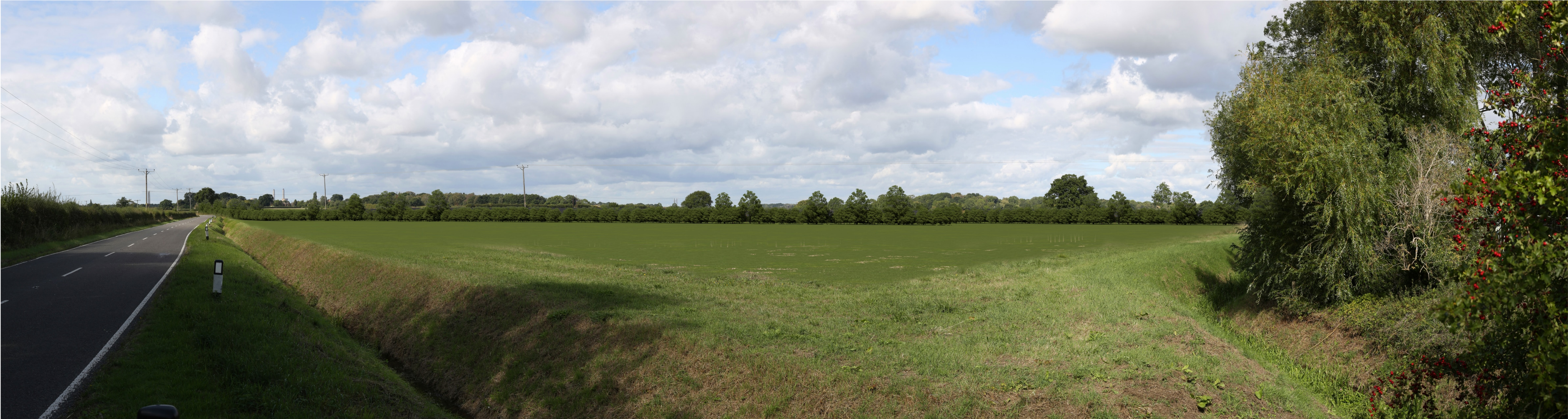
Proposed View Year 15 Distance to Nearest Order Limits 0m