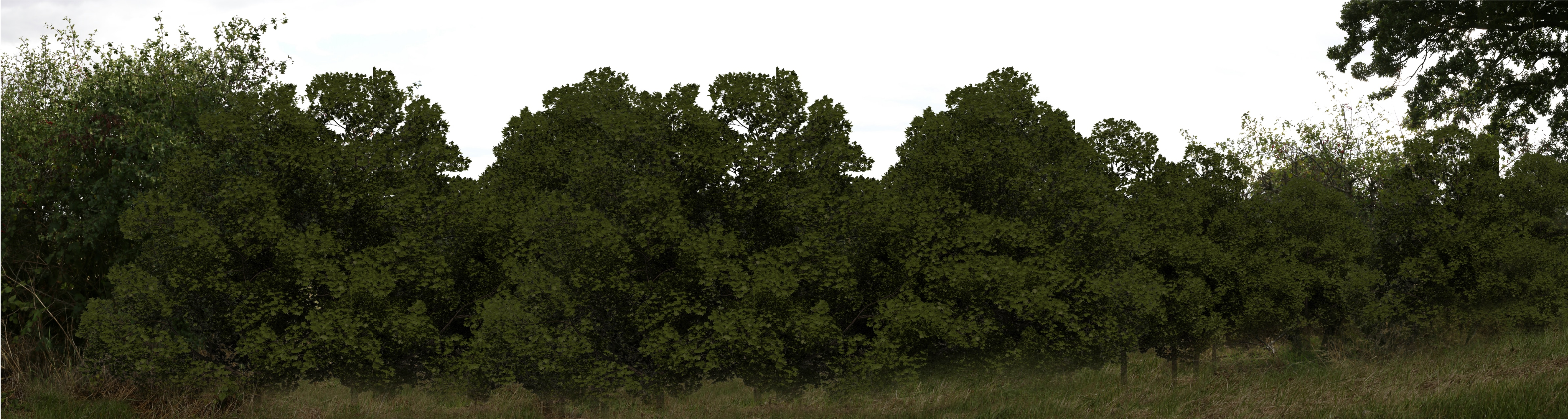
Proposed View Year 15 Distance to Nearest Order Limits 0m

Viewpoint 12 - Summer View south from Station Road west of Knaith Park Easting 385467 Northing 24 AOD Camera Type Lens Height Above AOD Angle of View Canon 5D MkIII 50mm 1.6m 120 ° Date Time 15/09/2022 13:44 Print Size A1