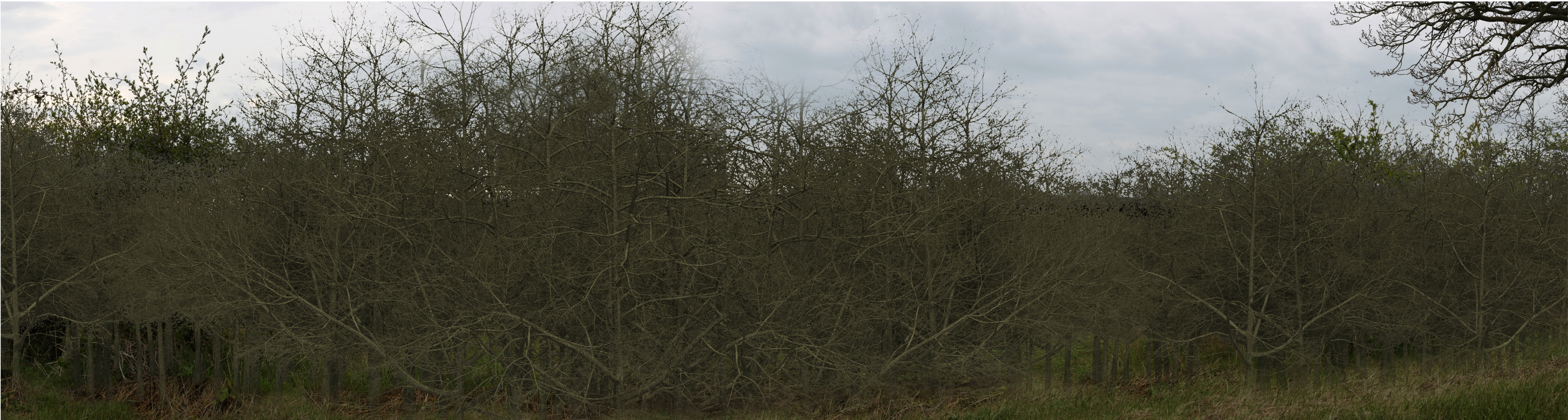
Proposed View Year 15 Distance to Nearest Order Limits 0m