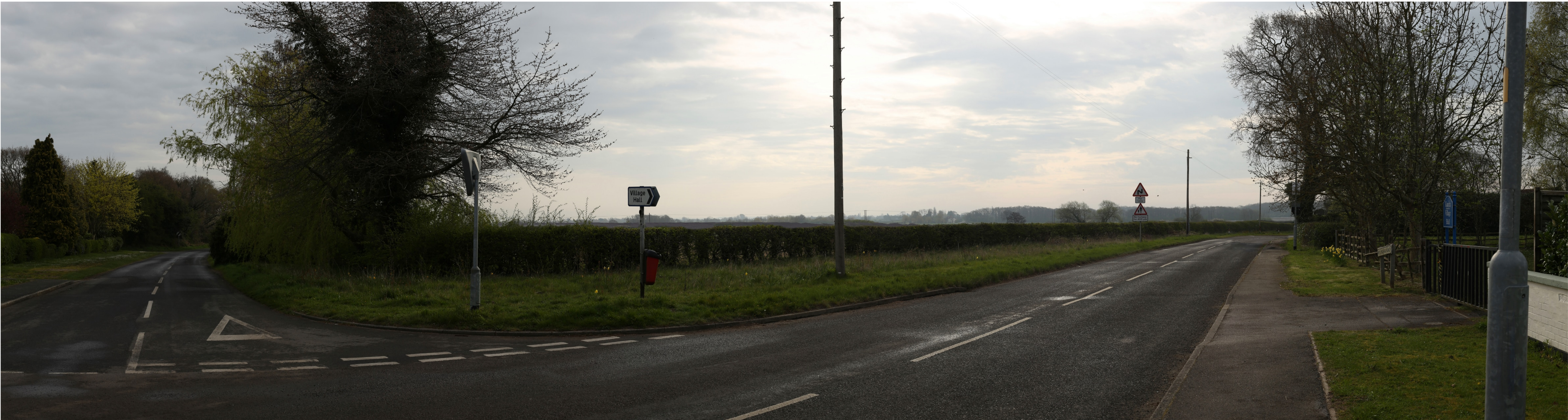
Proposed View Year 1 Distance to Nearest Order Limits 295m